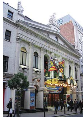
Theatre of World Renown: The London Palladium

I set off to London armed only with my demonstration tapes, an unemployment cheque, and an old suitcase. I walked with tears in my eyes for a mile to the local train station, it was so sad to be leaving my village home in Wales. On the walk to the train station it felt as though I was finally saying goodbye to my happy childhood days, it was time to leave the nest and fly on my own. On the one hand there was sadness, on the other great expectations, what would London have in store for me, where would this adventure lead? I prayed for God to help