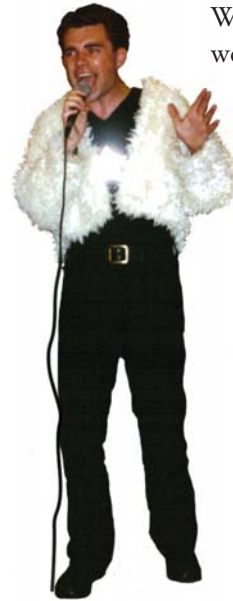
Singing in my favourite group Rentintwain! Wearing my trademark ☆ t-shirt