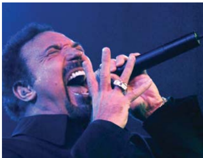
Tom Jones, known within the music industry as ‘The Voice’.

‘called’ into music. Instead, I knew for sure that I was being ‘called’ by God to preach the greatest news ever given to mankind, the Gospel of Jesus